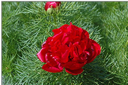
Double Fernleaf Peony flowers