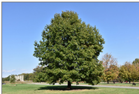
Scarlet Oak