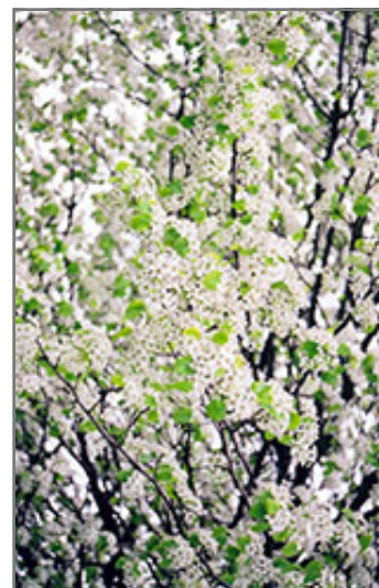
Bradford Ornamental Pear flowers