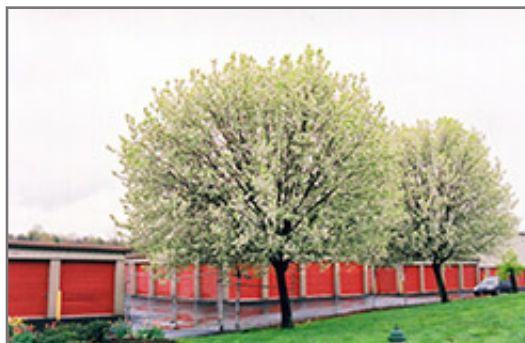
Bradford Ornamental Pear in bloom

Bradford Ornamental Pear is recommended for the following landscape applications;