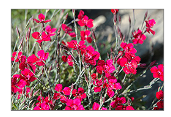
Brilliant Maiden Pinks flowers

Vigorous and free flowering, this selection features lovely frilly cherry red flowers, spreading across a low growing mat of green foliage; drought tolerant and easy to grow, ideal for rock gardens, borders or used as groundcover