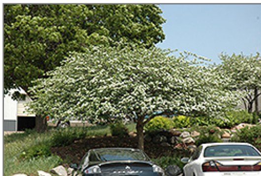
Thornless Cockspur Hawthorn in bloom

Thornless Cockspur Hawthorn will grow to be about 25 feet tall at maturity, with a spread of 25 feet. It has a low canopy with a typical clearance of 3 feet from the ground, and is suitable for planting under power lines. It grows at a slow rate, and under ideal conditions can be expected to live for 50 years or more.