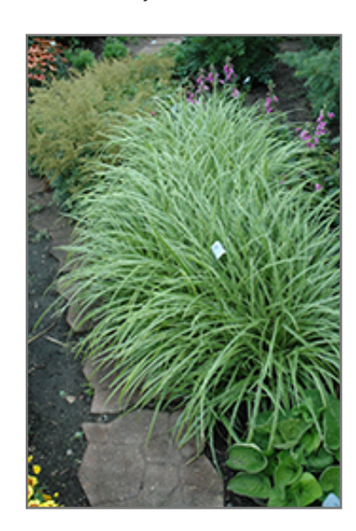
Ice Dance Sedge