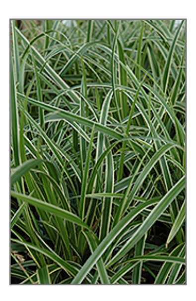
Ice Dance Sedge foliage