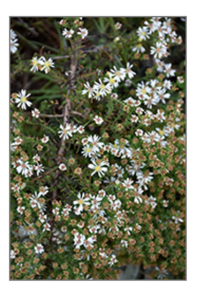
Snow Flurry Aster flowers

A drought tolerant, low growing, spreading variety that looks stunning in rock gardens, borders or as groundcover; features narrow green foliage and small, dainty white flowers that bloom during the fall; easy to grow, requiring little to no maintenance