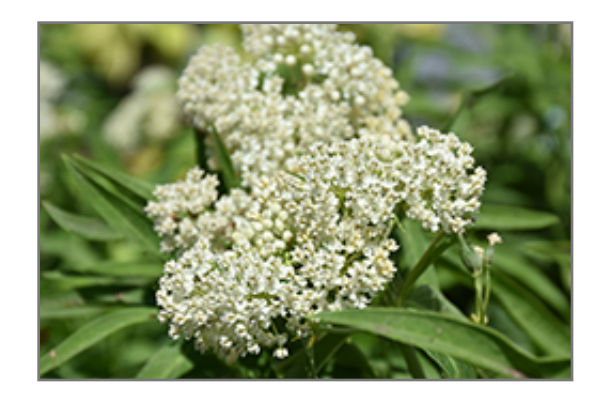
Ice Ballet Milkweed flowers

This is a relatively low maintenance plant, and is best cleaned up in early spring before it resumes active growth for the season. It is a good choice for attracting butterflies to your yard, but is not particularly attractive to deer who tend to leave it alone in favor of tastier treats. It has no significant negative characteristics.