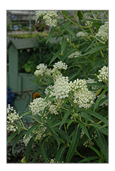
Ice Ballet Milkweed flowers

Ice Ballet Milkweed is recommended for the following landscape applications;