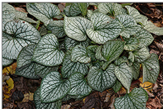
Jack Frost Bugloss foliage

Jack Frost Bugloss is recommended for the following landscape applications;