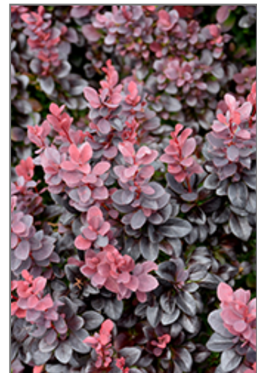
Concorde Japanese Barberry foliage