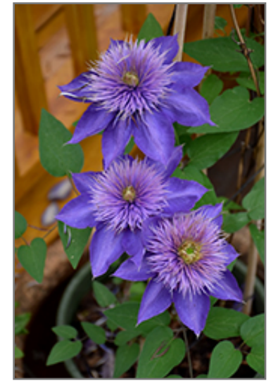
Multi Blue Clematis flowers

Multi Blue Clematis is a multi-stemmed deciduous woody vine with a twining and trailing habit of growth. Its average texture blends into the landscape, but can be balanced by one or two finer or coarser trees or shrubs for an effective composition.