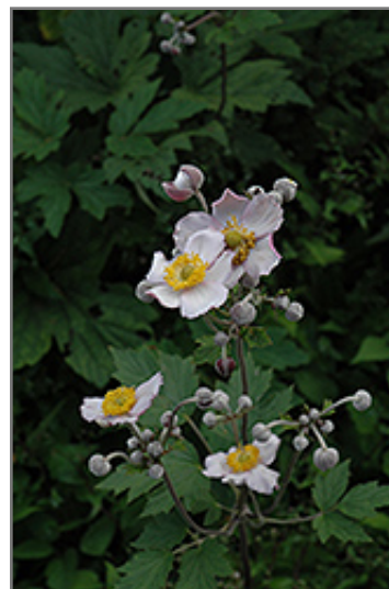
Grapeleaf Anemone flowers