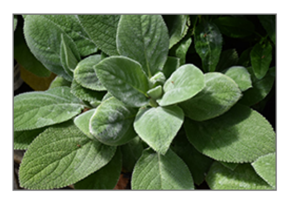
Giant Lamb's Ears foliage