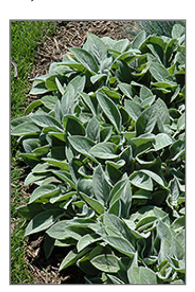
Giant Lamb's Ears