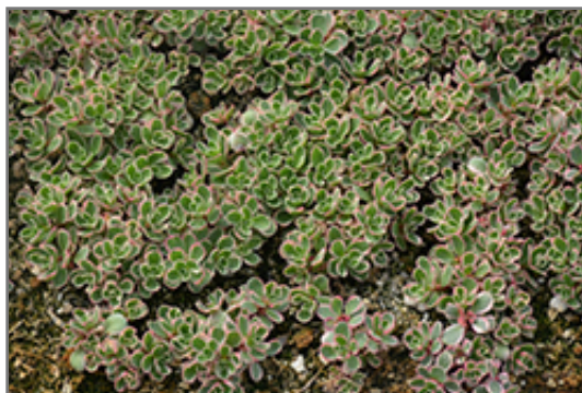
Tricolor Stonecrop flowers

Tricolor Stonecrop is a fine choice for the garden, but it is also a good selection for planting in outdoor pots and containers. Because of its spreading habit of growth, it is ideally suited for use as a 'spiller' in the 'spiller-thriller-filler' container combination; plant it near the edges where it can spill gracefully over the pot. Note that when growing plants in outdoor containers and baskets, they may require more frequent waterings than they would in the yard or garden.