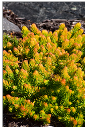
Angelina Stonecrop foliage