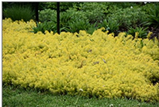
Angelina Stonecrop

This plant does best in full sun to partial shade. It prefers dry to average moisture levels with very well-drained soil, and will often die in standing water. It is considered to be drought-tolerant, and thus makes an ideal choice for a low-water garden or xeriscape application. It is not particular as to soil pH, but grows best in poor soils, and is able to handle environmental salt. It is highly tolerant of urban pollution and will even thrive in inner city environments. This is a selected variety of a species not originally from North America. It can be propagated by division; however, as a cultivated variety, be aware that it may be subject to certain restrictions or prohibitions on propagation.