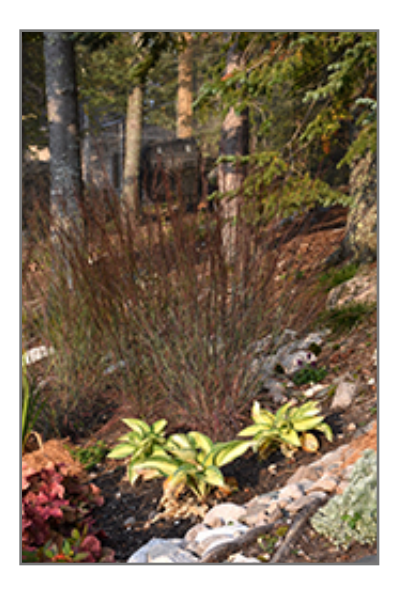
The Blues Bluestem

This plant should only be grown in full sunlight. It is very adaptable to both dry and moist locations, and should do just fine under typical garden conditions. It is considered to be drought-tolerant, and thus makes an ideal choice for a low-water garden or xeriscape application. It is not particular as to soil type or pH. It is somewhat tolerant of urban pollution. This is a selection of a native North American species. It can be propagated by division; however, as a cultivated variety, be aware that it may be subject to certain restrictions or prohibitions on propagation.