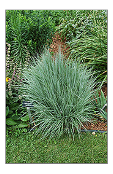
The Blues Bluestem