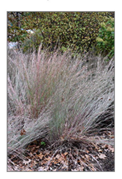
The Blues Bluestem in fall