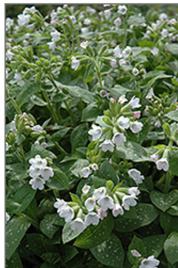
Sissinghurst White Lungwort flowers