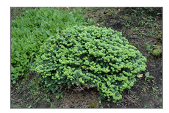
Dwarf Balsam Fir

Dwarf Balsam Fir will grow to be about 24 inches tall at maturity, with a spread of 3 feet. It tends to fill out right to the ground and therefore doesn't necessarily require facer plants in front. It grows at a slow rate, and under ideal conditions can be expected to live for 50 years or more.