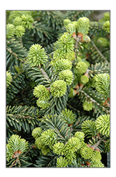
Dwarf Balsam Fir foliage