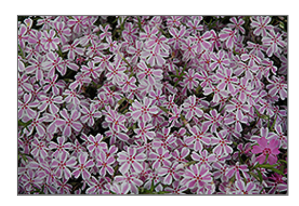
Candy Stripe Moss Phlox flowers