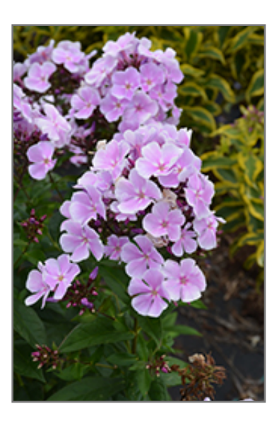
Franz Schubert Garden Phlox flowers

Franz Schubert Garden Phlox features bold fragrant conical lavender star-shaped flowers at the ends of the stems from early summer to early fall. The flowers are excellent for cutting. Its narrow leaves remain green in color throughout the season.