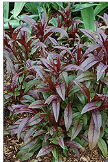
Husker Red Beard Tongue foliage