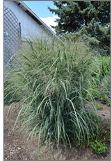
Northwind Switch Grass in bloom

This plant does best in full sun to partial shade. It is very adaptable to both dry and moist locations, and should do just fine under typical garden conditions. It is considered to be drought-tolerant, and thus makes an ideal choice for a low-water garden or xeriscape application. It is not particular as to soil type, but has a definite preference for alkaline soils, and is able to handle environmental salt. It is somewhat tolerant of urban pollution. This is a selection of a native North American species. It can be propagated by division; however, as a cultivated variety, be aware that it may be subject to certain restrictions or prohibitions on propagation.