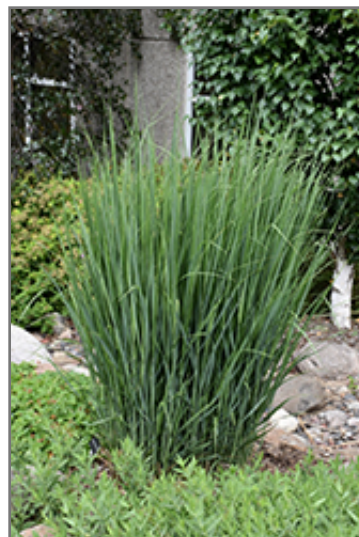
Northwind Switch Grass

Northwind Switch Grass will grow to be about 4 feet tall at maturity, with a spread of 3 feet. It tends to be leggy, with a typical clearance of 1 foot from the ground, and should be underplanted with lower-growing perennials. It grows at a medium rate, and under ideal conditions can be expected to live for approximately 15 years. As an herbaceous perennial, this plant will usually die back to the crown each winter, and will regrow from the base each spring. Be careful not to disturb the crown in late winter when it may not be readily seen!