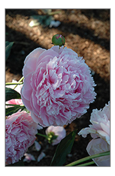
Shirley Temple Peony flowers

Shirley Temple Peony features bold lightly-scented white cup-shaped flowers with shell pink overtones and pink centers at the ends of the stems from late spring to early summer. The flowers are excellent for cutting. Its compound leaves remain green in color throughout the season.