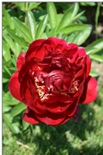
Buckeye Belle Peony flowers