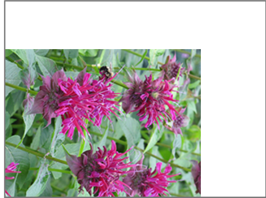
Raspberry Wine Beebalm flowers

This plant does best in full sun to partial shade. It is very adaptable to both dry and moist locations, and should do just fine under typical garden conditions. It is not particular as to soil type or pH. It is highly tolerant of urban pollution and will even thrive in inner city environments. This particular variety is an interspecific hybrid. It can be propagated by division; however, as a cultivated variety, be aware that it may be subject to certain restrictions or prohibitions on propagation.