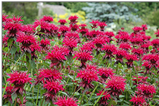
Raspberry Wine Beebalm flowers