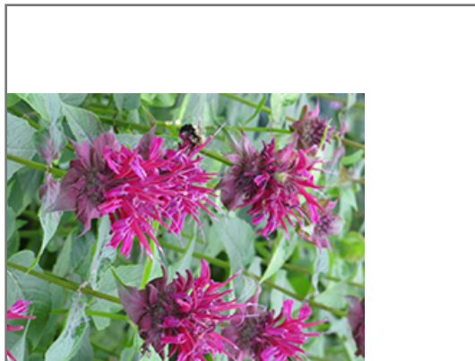
Raspberry Wine Beebalm flowers

This plant does best in full sun to partial shade. It is very adaptable to both dry and moist locations, and should do just fine under typical garden conditions. It is not particular as to soil type or pH. It is highly tolerant of urban pollution and will even thrive in inner city environments. This particular variety is an interspecific hybrid. It can be propagated by division; however, as a cultivated variety, be aware that it may be subject to certain restrictions or prohibitions on propagation.