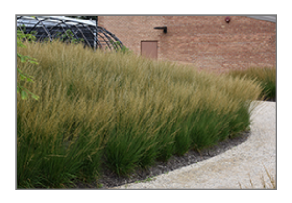
Moorflame Moor Grass