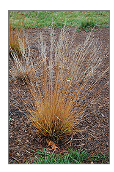
Moorflame Moor Grass in fall