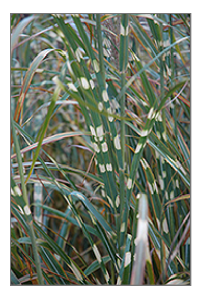
Zebra Grass foliage