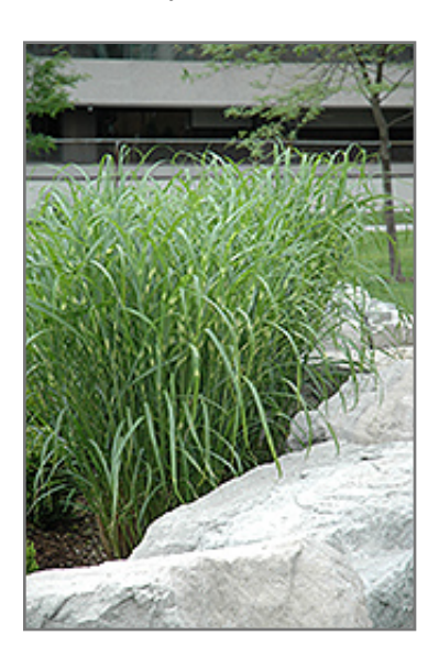
Zebra Grass