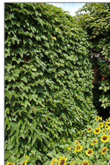
Boston Ivy