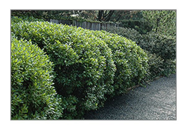
Northern Bayberry

Northern Bayberry is recommended for the following landscape applications;