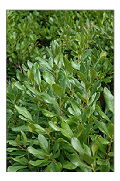
Northern Bayberry foliage