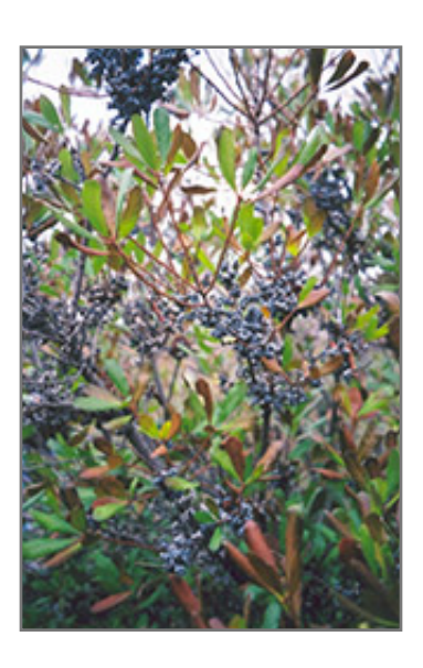
Northern Bayberry fruit

This shrub does best in full sun to partial shade. It does best in average to evenly moist conditions, but will not tolerate standing water. It is very fussy about its soil conditions and must have sandy, acidic soils to ensure success, and is subject to chlorosis (yellowing) of the foliage in alkaline soils, and is able to handle environmental salt. It is highly tolerant of urban pollution and will even thrive in inner city environments. This species is native to parts of North America.