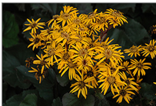
Britt Marie Crawford Rayflower flowers