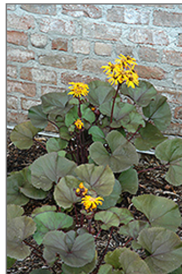
Britt Marie Crawford Rayflower in bloom