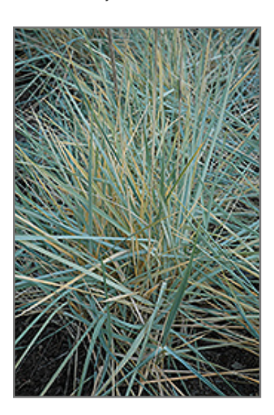
Blue Dune Lyme Grass in fall