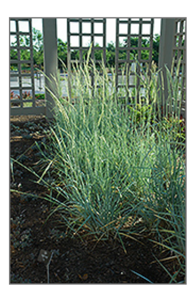
Blue Dune Lyme Grass

Blue Dune Lyme Grass will grow to be about 32 inches tall at maturity, with a spread of 3 feet. It tends to be leggy, with a typical clearance of 1 foot from the ground, and should be underplanted with lower-growing perennials. It grows at a fast rate, and under ideal conditions can be expected to live for approximately 10 years. As an herbaceous perennial, this plant will usually die back to the crown each winter, and will regrow from the base each spring. Be careful not to disturb the crown in late winter when it may not be readily seen!