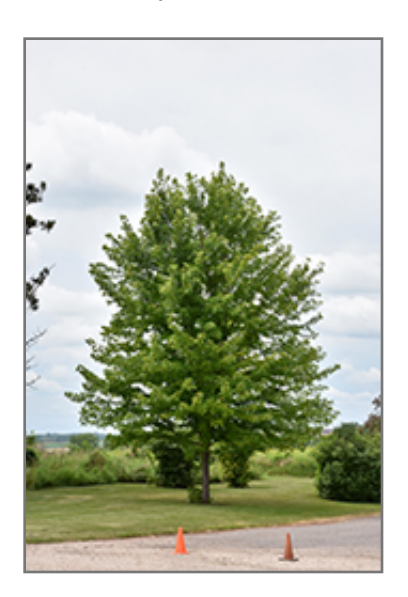
Autumn Blaze Maple