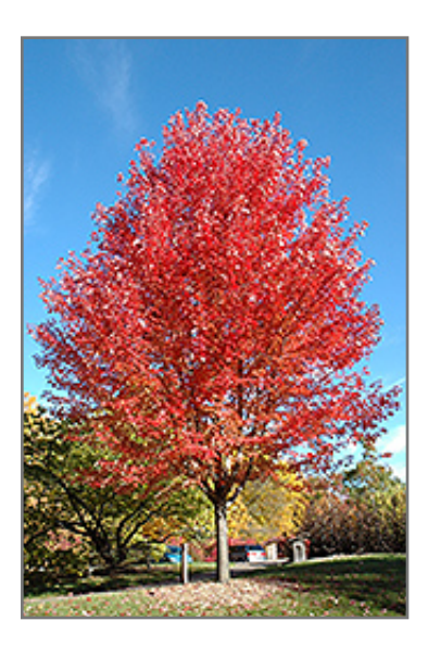
Autumn Blaze Maple in fall