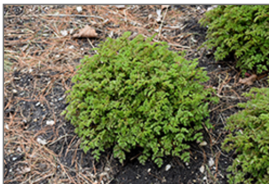
Chantilly Lace Goatsbeard