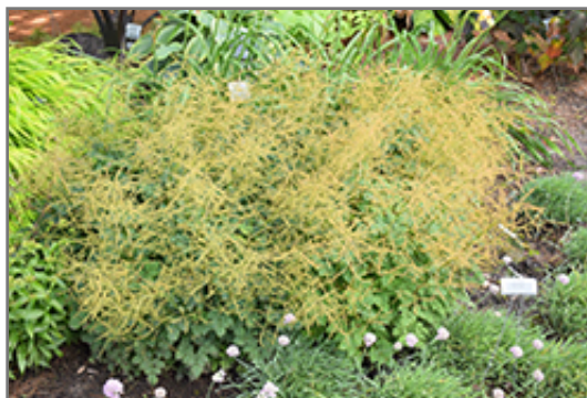
Chantilly Lace Goatsbeard flowers (faded)