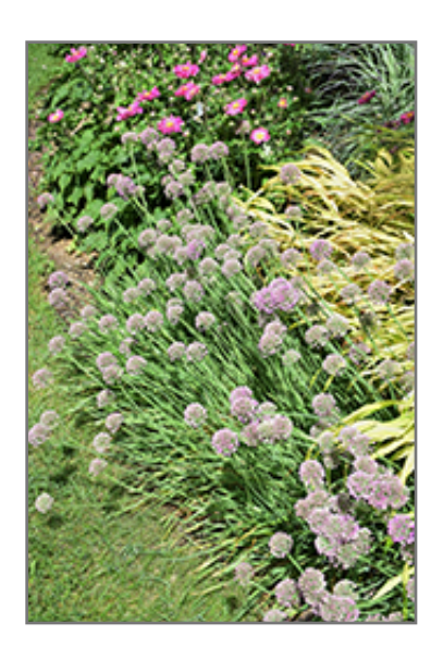
Medusa Ornamental Onion in bloom