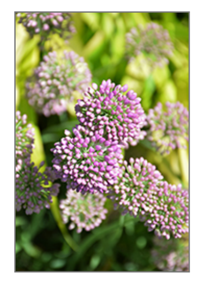
Medusa Ornamental Onion flower buds