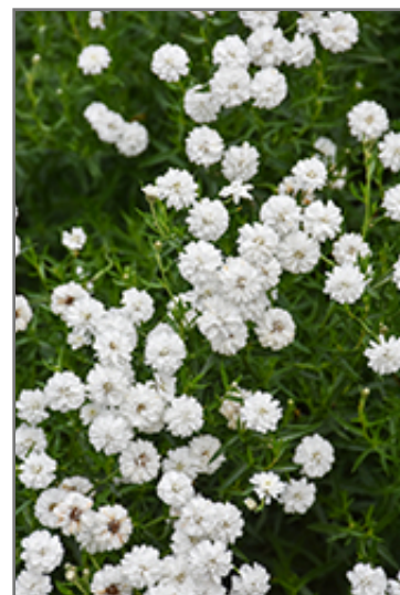
Peter Cottontail Yarrow flowers