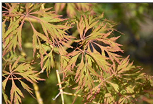
Ice Dragon Maple foliage