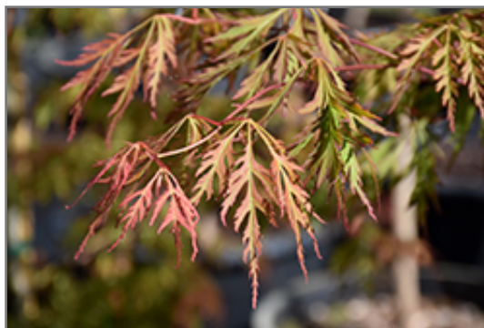
Ice Dragon Maple foliage

Ice Dragon Maple is recommended for the following landscape applications;