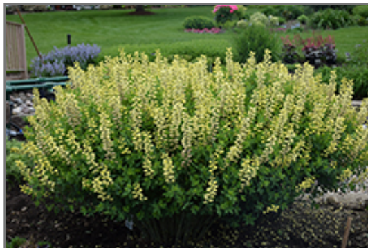
Decadence Lemon Meringue False Indigo in bloom

Decadence Lemon Meringue False Indigo is a fine choice for the garden, but it is also a good selection for planting in outdoor pots and containers. With its upright habit of growth, it is best suited for use as a 'thriller' in the 'spiller-thriller-filler' container combination; plant it near the center of the pot, surrounded by smaller plants and those that spill over the edges. It is even sizeable enough that it can be grown alone in a suitable container. Note that when growing plants in outdoor containers and baskets, they may require more frequent waterings than they would in the yard or garden.