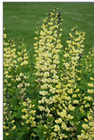
Decadence Lemon Meringue False Indigo flowers

This is a relatively low maintenance plant, and is best cleaned up in early spring before it resumes active growth for the season. It is a good choice for attracting bees and butterflies to your yard, but is not particularly attractive to deer who tend to leave it alone in favor of tastier treats. It has no significant negative characteristics.