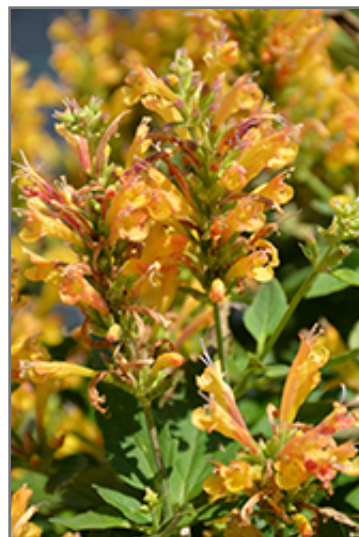
Poquito Butter Yellow Hyssop flowers