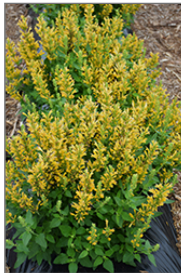
Poquito Butter Yellow Hyssop in bloom