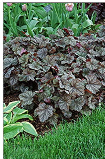
Pewter Veil Coral Bells