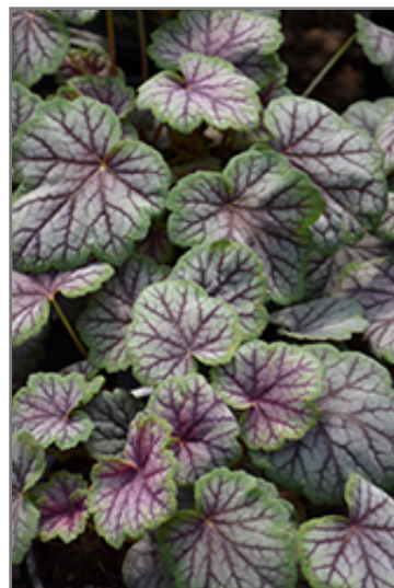
Green Spice Coral Bells foliage