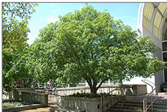
Purpleblow Maple

Purpleblow Maple will grow to be about 20 feet tall at maturity, with a spread of 15 feet. It has a low canopy with a typical clearance of 4 feet from the ground, and is suitable for planting under power lines. It grows at a slow rate, and under ideal conditions can be expected to live for 70 years or more.