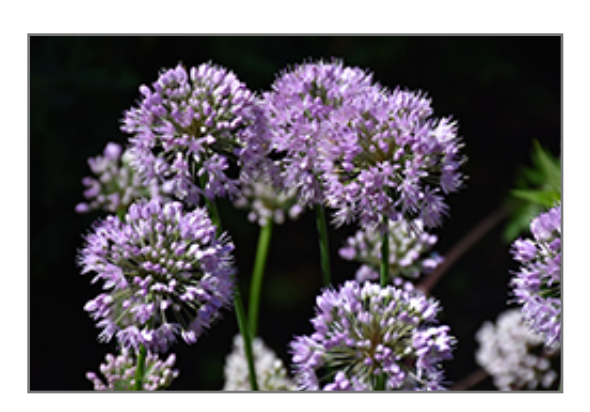
Mauve Garlic Chives flowers

A lovely ornamental and edible selection, ideal for window boxes, patio containers or herb gardens; showcasing edible green, grass-like foliage topped with fragrant mauve flowers; a mildly zesty addition to salads, marinades or dried for seasonings