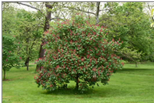
Splendens Red Buckeye in bloom