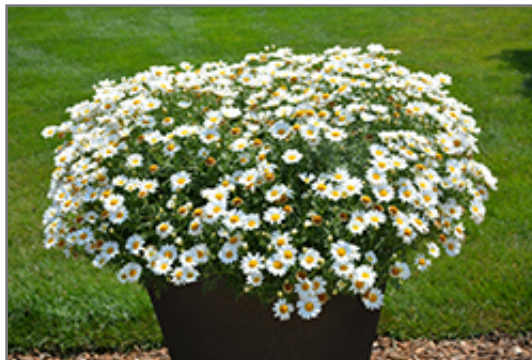
Pure White Butterfly Marguerite Daisy in bloom

Pure White Butterfly Marguerite Daisy is a fine choice for the garden, but it is also a good selection for planting in outdoor pots and containers. It is often used as a 'filler' in the 'spiller-thriller-filler' container combination, providing a mass of flowers against which the larger thriller plants stand out. Note that when growing plants in outdoor containers and baskets, they may require more frequent waterings than they would in the yard or garden.