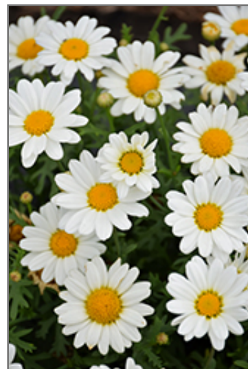
Pure White Butterfly Marguerite Daisy flowers