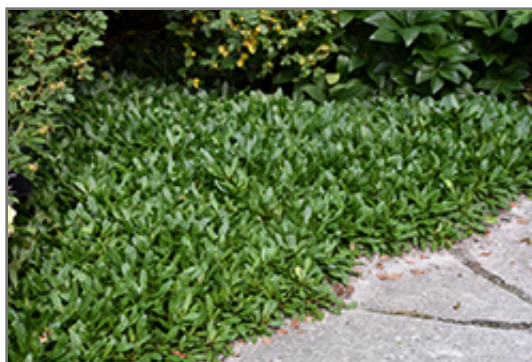
Emerald Chip Bugleweed