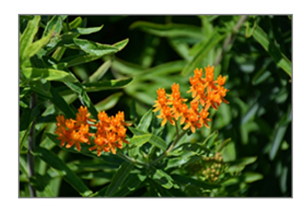
Butterfly Weed flowers

Masses of tiny blossoms in brilliant shades of orange, attracts butterflies to the garden; blooms last several weeks, and plants are drought tolerant and resistant to pests; will flower the first year with an early sowing