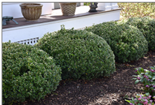
Sprinter Boxwood

Sprinter Boxwood makes a fine choice for the outdoor landscape, but it is also well-suited for use in outdoor pots and containers. Because of its height, it is often used as a 'thriller' in the 'spiller-thriller-filler' container combination; plant it near the center of the pot, surrounded by smaller plants and those that spill over the edges. It is even sizeable enough that it can be grown alone in a suitable container. Note that when grown in a container, it may not perform exactly as indicated on the tag - this is to be expected. Also note that when growing plants in outdoor containers and baskets, they may require more frequent waterings than they would in the yard or garden.