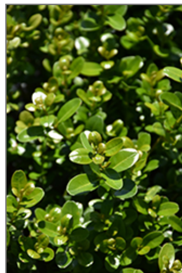
Sprinter Boxwood foliage