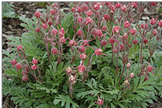
Prairie Smoke in bloom