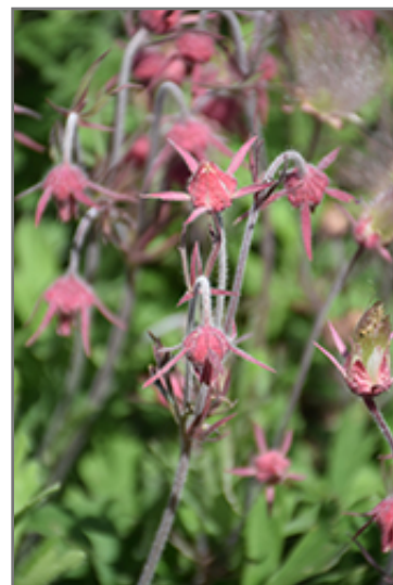
Prairie Smoke flower buds