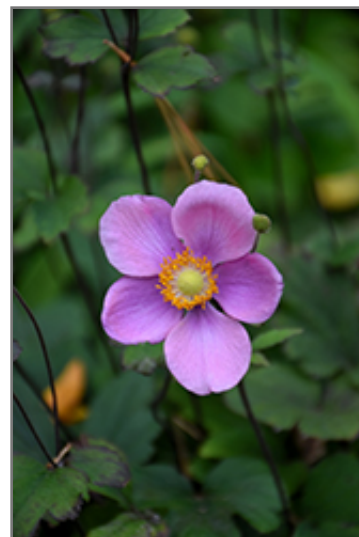
Lucky Charm Anemone flowers