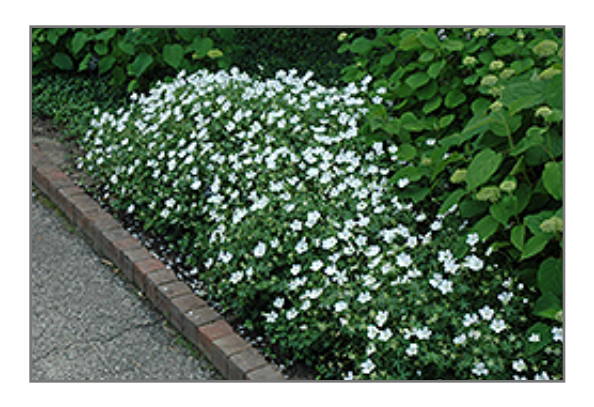
White Cranesbill in bloom

White Cranesbill has masses of beautiful white flowers at the ends of the stems from late spring to mid summer, which are most effective when planted in groupings. Its deeply cut lobed palmate leaves are dark green in color. As an added bonus, the foliage turns a gorgeous dark red in the fall.