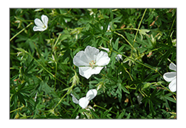
White Cranesbill flowers